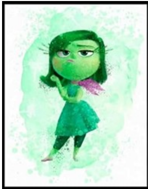
MEET THE LITTLE VOICES INSIDE YOUR HEAD.